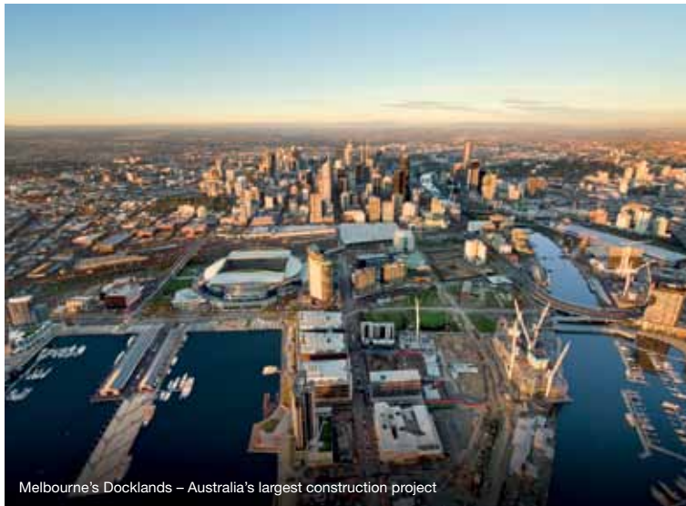
Melbourne's Docklands – Australia's largest construction project